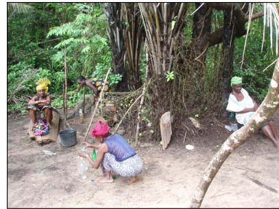
Operators of a Sacred Grove, southern Guinea-Bissau, West Africa

which privileges local religious experiences and practices and places them in socio-cultural context. Cosmologies, religious systems and magical systems of thought are explored from an anthropological perspective. Students exit this course with a sense that anthropology does have an invaluable, distinctive approach to religion and human life.