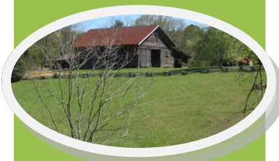
"In The Valley"

This two week class had a considerable amount of outdoor activity and strenuous exercise. The class learned to identify types of geology and different species of plants, native trees, and wildflowers. The course is intended to provide both academic training and expertise working in an anthropological fieldwork research environment.